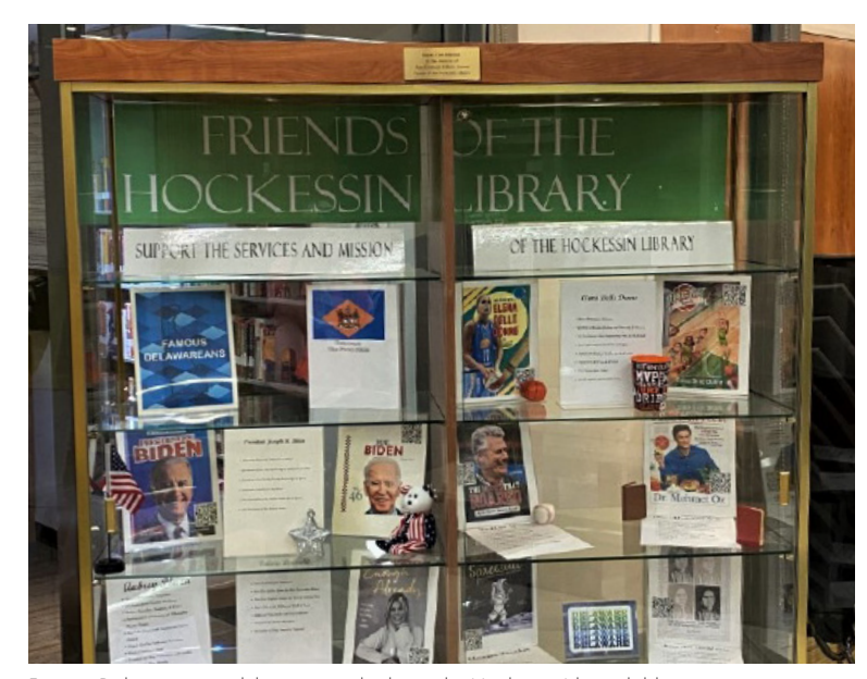
Famous Delawareans exhibit now on display in the Hockessin Library lobby.

Famous Delawareans will be on display through the end of November 2022.